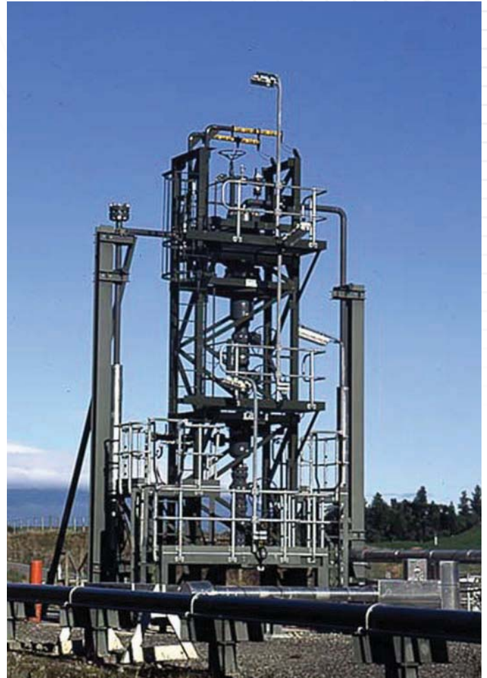
Shell Mangahewa CYCLONIXX® Wellhead Desander Package Location: New Zealand

In gas streams, pressure drops across the Wellhead Desander Unit can be very low (eg: \leftarrow 5 psi / 0.35 Bar) and separation efficiencies can be very high due to the low gas viscosity (compared to liquids).